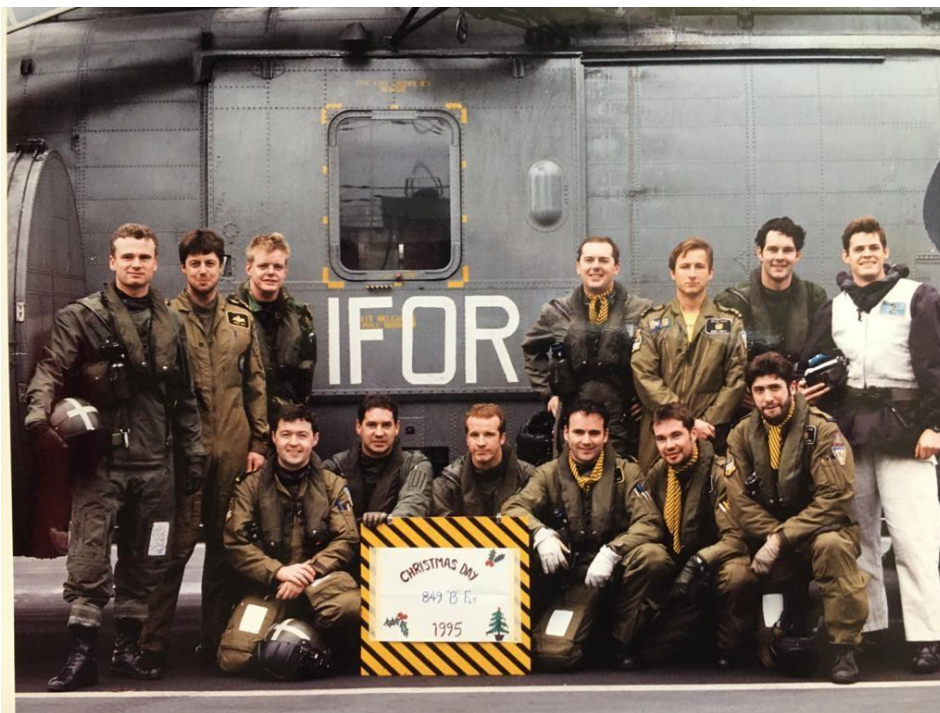
B Flt in the Adriatic, Christmas Day 1995