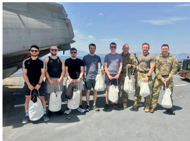
Battle bags at the ready!

Most recently, the CSG transited south from Japan to Singapore through one of the world's most contested waterways, accompanied by ships from Japan, Canada, Australia, the USA, and South Korea, among others. ASaC was once again called upon in its core role, with crews maintaining alert periods throughout the transit.