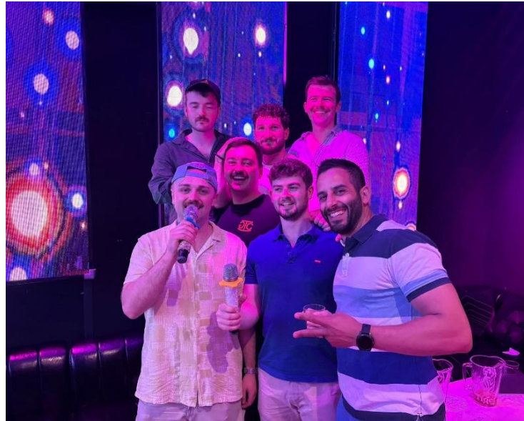
Karaoke in Singapore

As we enter the final phase of the deployment, we still face the challenges of the Indian Ocean, the Red Sea, and the concluding Carrier Strike Group FOC exercise. We're expecting some demanding flying ahead, but spirits are high as we look forward to returning home in time for Christmas.