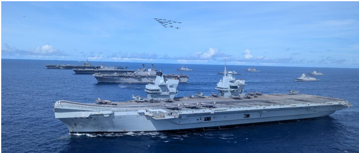
The view from the cockpit during a PHOTEX

As we enter the final phase of the deployment, we still face the challenges of the Indian Ocean, the Red Sea, and the concluding Carrier Strike Group FOC exercise. We're expecting some demanding flying ahead, but spirits are high as we look forward to returning home in time for Christmas.