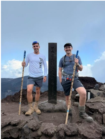
Climbing Mt Fuji

While much of our time has been spent at sea, the Task Group has also visited some incredible locations - including Singapore (twice), Darwin, and Tokyo. These stops have given the Baggers a chance to unwind and explore: camping in the Australian Outback, discovering the vibrant streets of Singapore, and travelling across Japan, with highlights including Hiroshima and a climb up Mt Fuji. For many of our junior observers, this is their first posting, and these experiences have offered a fantastic introduction to life on a frontline squadron.