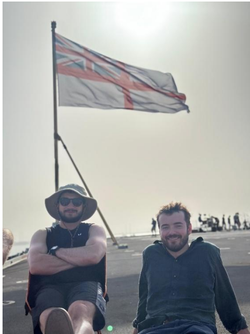
Relaxing on the Flight Deck

Beyond the Red Sea, flying operations resumed with ASaC playing a key role in Exercise TALISMAN SABRE off northern Australia, a fifth-generation exercise designed to test F-35 interoperability with partner nations. Integration with our own F-35s and embarked Fighter Controllers has been central to strengthening the CSG's air warfare capability.