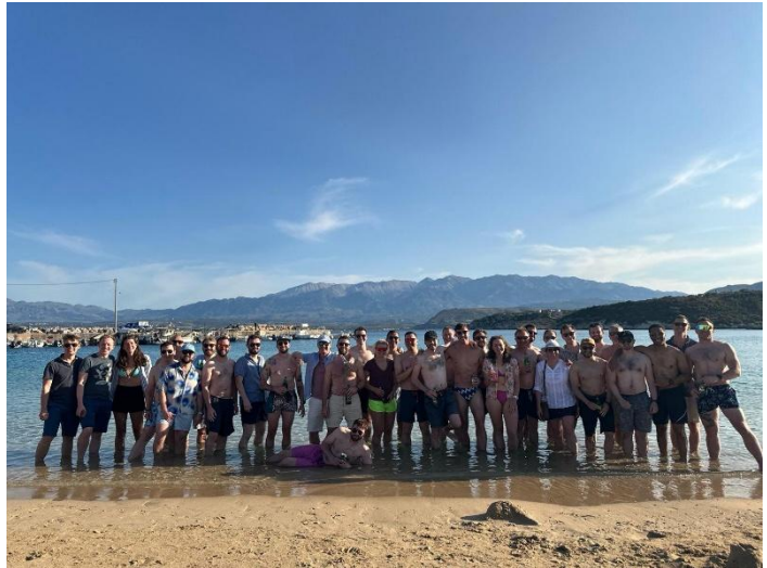
Squadron aircrew in Chania

A brief stop in Chania, Crete, offered a welcome pause before we transited the Suez Canal and entered the Red Sea. If there's one takeaway from our time there, it's that AEW, Fighter Control, and Tactical Command and Control remain absolutely vital to the effectiveness of the Task Group. Merlin ASaC performed admirably throughout, maintaining station and safeguarding the fleet alongside UK, US, and allied aircraft.